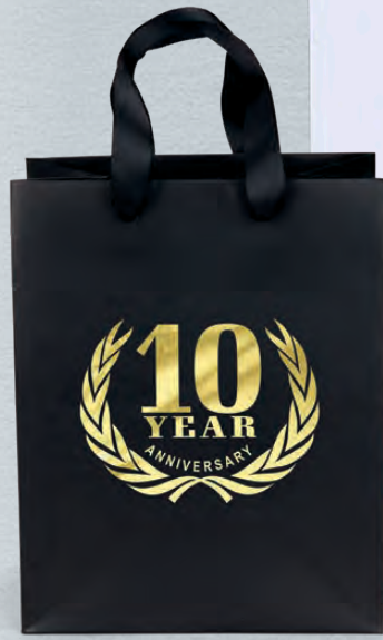
ELIZABETH FOIL PRINT