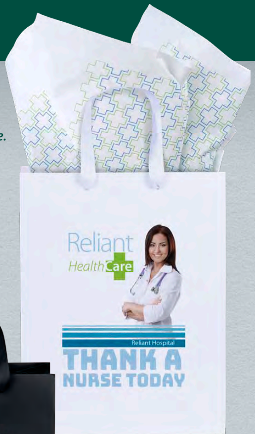
MARY DYNAMIC COLOR

Shipping: 25 lbs. per box of 125 Imprint Area: Front/Back – 6W x 5H (Foil Print) Front – 8W x 7½H (Dynamic Color)