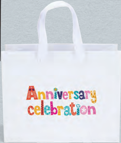
VICTORIA DYNAMIC COLOR