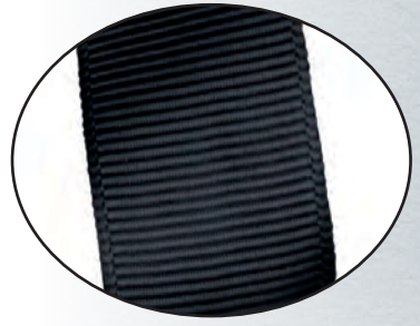
Close up of 12" grosgrain ribbon